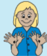
all done Turns palms upward and then outward.