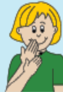
thank you Touch lips with open hand. Move hand away from face, palm upward. Smile.