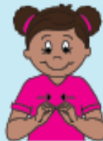
more Bring fingertips together a few times.