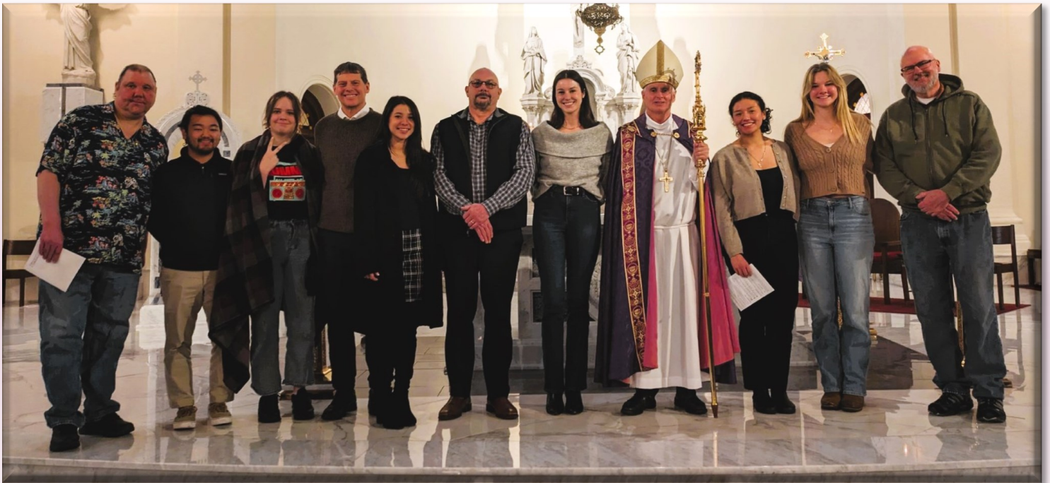
Our Elect and their sponsors at the Rite of Election on Feb. 18, 2024.

The “Scrutinies of the Elect” take place during the three Sundays before Palm Sunday. Scrutiny is a word that means “to search,” to look for. In modern English, it is used to mean, “a critical observation or examination.” That is exactly what it’s meant to be.